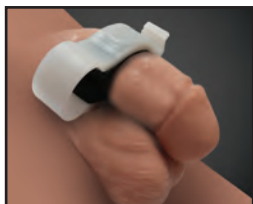
Can be used for retraction and uncircumcised anatomy.

After application is complete, remove the KindKlamp and clean as indicated on the backside of this insert.