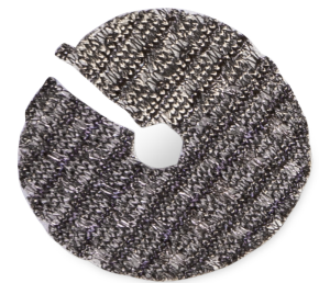
Silverlon® Lifesaver™ IV Catheter Dressing 1" 4.0mm I.D.

SILVERLON® Lifesaver™ IV Catheter Discs are an antimicrobial dressing with a unique permanent silverplated metallic surface ideal for IVs, central lines, pin sites, VAD drivelines, ECMO Cannulas and chest tubes. Utilizing a large reservoir of silver ions, Lifesaver Discs continuously deliver an effective level of silver ions in the dressing for up to 7 days.